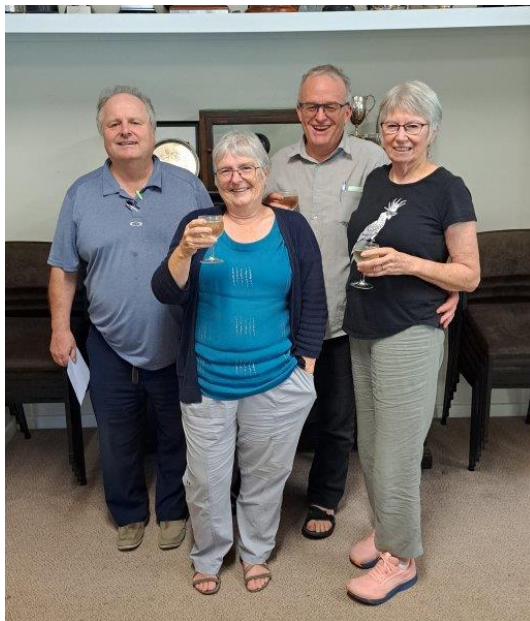
Winners of the Mixed Team trial

Congratulations and Good Luck to you all!